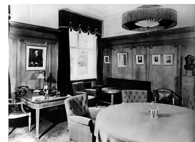
Solid furnishings – Managing Board member's office, Berlin 1920s

By the end of 1913 the second building stage had almost been completed and the administrative employees working in central Berlin began to move to Nonnendamm. After only a few months, around 3,000 people were working in the multi-storey building, a complex composed of several wings. Most people worked in so-called office halls with up to 100 workplaces. Comfort and separate offices, and rooms with elegant furnishing, were reserved for the Managing Board, senior managers and holders of commercial and registered powers of attorney and for the reception of visitors.