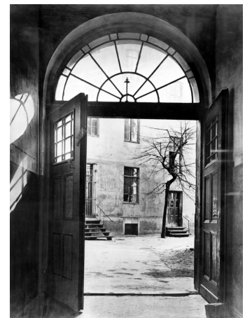
Workplace and apartment in one – View of the first workshop of Siemens & Halske, Berlin undated

The “Telegraphen-Bauanstalt von Siemens & Halske” commenced operation on October 12, 1847, in a Berlin apartment building complex. The 150-square-meter workshop was situated in a rear building at Schöneberger Straße 19, right opposite Anhalter station. The firm’s two founders lived in the same building. At first the company employed ten people, mostly locksmiths and mechanics. The capacities of the first workshop were soon exhausted; in 1852 Siemens moved to the nearby Markgrafenstraße 94. In the previous year the company had acquired a plot together with a four-storey residential building, the conversion of which had now been completed.