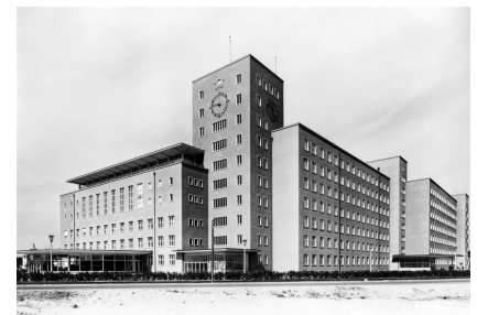
Resembling the brick buildings in Siemensstadt – „Himbeerpalast“, Erlangen 1953

On completion, the office building had 46,000 square meters of floor space. It housed the administrative departments of Siemens-Schuckertwerke, whose registered offices were transferred from Berlin to Erlangen on April 1, 1949. The building was ready for occupancy in time for the company’s fiftieth anniversary celebrations in April 1953 and was opened in the presence of Ludwig Erhard, the German Minister of Economics. Around 4,000 employees worked in the administrative complex at that time. In 1991, the Himbeerpalast, which owes its nickname to the reddish color of its façade, was listed as a protected building by the Bavarian State Office for the Preservation of Historic Monuments – as the first postwar building in Erlangen.