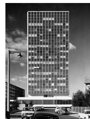
Highest office tower in Bavaria at the time – The Glass Palace, Erlangen 1962

In the fall of 2010, the building, which had been a listed historic monument since 2009, was sold. Siemens has leased the building back until the 50-hectare Siemens Campus in the south of Erlangen is completed.