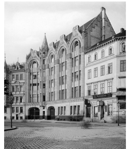
Representative building in Berlin – Premises on Askanischer Platz, Berlin circa 1903