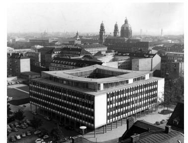
Elegant design – Administration building on Oskar-von-Miller-Ring, Munich 1958

By 1957, a six-storey building with recessed ground and top floors had been created around a nearly square inner courtyard. The flat roof swings out concavely on all four sides. Besides offices, the building complex at Oskar-von-Miller-Ring 18 housed exhibition and training rooms as well as three lecture halls. The elegantly proportioned building set a trend for Munich's postwar architecture. In 1999, Siemens sold the administration building to Münchener Rückversicherung. A year later, it was placed on the list of protected monuments.