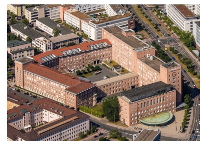
Clearly visible thanks the reddish colour – Himbeerpalast from the air, Erlangen 2015