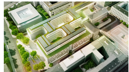
Tradition meets future – Design by Henning Larsen Architects, 2011

Within a few years, one of the world's most modern buildings arose in the heart of Munich. Combining an advanced architectural design with high-efficiency technologies, the new building meets the highest standards for sustainability and resource conservation and provides a modern, inspiring work environment for some 1,200 employees on about 45,000 square meters of above-ground floor space. The ground floor – which includes green inner courtyards, a café, a restaurant and a fountain – is publicly accessible. This passage provides the citizens of Munich and visitors to the Bavarian capital with a new footpath between downtown Munich and the city's museum district. The address of the new headquarters: Werner-von-Siemens-Straße 1.