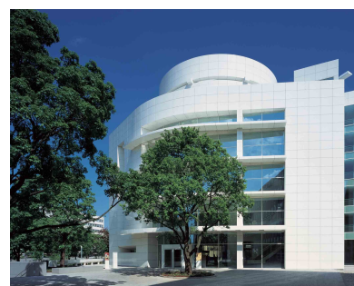
Meeting place with publicly accessible rotunda – SiemensForum, Munich 1999

In cooperation with Siemens Immobilien Management (today Siemens Real Estate), which was established in 1994, and Gunter R. Standke, Siemens' head architect, work was begun in 1997 on an office building for around 1,000 employees. The façades of the reinforced concrete skeleton structure, which enclosed two inner courtyards, were covered by white aluminum panels and generously articulated glazing. The building's most striking feature was a publicly accessible rotunda, which housed, among other things, exhibition spaces, an auditorium and a café-bistro. The first offices were ready for occupancy in June 1999. In September of that year, the new SiemensForum was opened as a platform for dialogue with customers and the general public. In 2013, after work had begun on the new Munich headquarters building on Wittelsbacherplatz, the SiemensForum was sold and leased back until 2016.