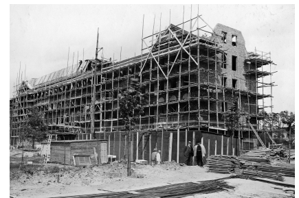
Buildings for the „Construction and Accounting Office” – Work on the first stage of the building, Berlin 1910

In fall 1910 work began on a building on the corner of Nonnendammallee and Rohrdamm for the “Construction and Accounting Office” of the booming heavy engineering department (Dynamowerk). This was the first step in the direction of a central administrative building which was to house both the administrative departments of the Siemens-Schuckertwerke GmbH (SSW) founded in 1903 and those of Siemens & Halske AG. The first employees began working in the new administrative building in January 1911.