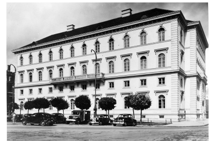
Headquarters in the heart of the Bavarian state capital – Ludwig Ferdinand Palais, Munich 1949

After World War Two, four-fifths of corporate assets were destroyed. In view of the politically unstable situation in the traditional location of Berlin, the company management decided to transfer the headquarters of Siemens & Halske to Munich. In fall 1949, the new Munich central administrative offices opened in the Ludwig Ferdinand Palais at Wittelsbacherplatz 2. The building was erected in 1825 from plans by Leo von Klenze, the court architect of Ludwig I, King of Bavaria. With its acquisition of the Neoclassical city palace in 1957, Siemens emphasized the importance of the Munich location. In the postwar years, the electrical engineering company developed to become one of the largest private-sector employers in the Bavarian capital.