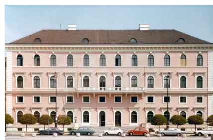
Elegant façade, representative appearance – Palais Ludwig Ferdinand, Munich 1978

The palace at Wittelsbacherplatz 2 is the headquarters and symbol of Siemens AG, which was established in 1966. For many years, the main entrance was located on the building's east side, which faces Odeonsplatz. In 1968, an outdoor staircase was constructed on the building's south side. It is to this staircase, which is based on a design by Hans Maurer, that the building's Wittelsbacherplatz façade owes its present appearance. In 1978, Wittelsbacherplatz was redesigned. What had previously been a parking lot was converted into a pedestrian area on the edge of the downtown pedestrian zone.