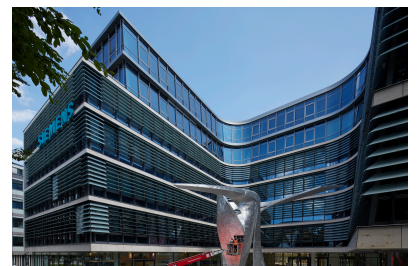
Futuristic, highly efficient and sustainable – Final works prior to the opening, Munich 2016