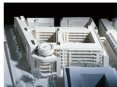
Office building with aluminium panels and glass – Model of SiemensForum, Munich 1997

At the end of the 1990s, the company's Munich headquarters were expanded at Oskar-von-Miller-Ring 20 by the addition of the so-called SiemensForum. The complex filled one of the last gaps in the Munich cityscape caused by the war. The history of the office building began in 1983, when renowned New York architect Richard Meier won the design competition. However, concrete planning was delayed until 1991 by work on the office and laboratory complex on Munich's Hofmannstrasse.