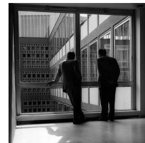
Well proportioned – View of the inner courtyard, 1957