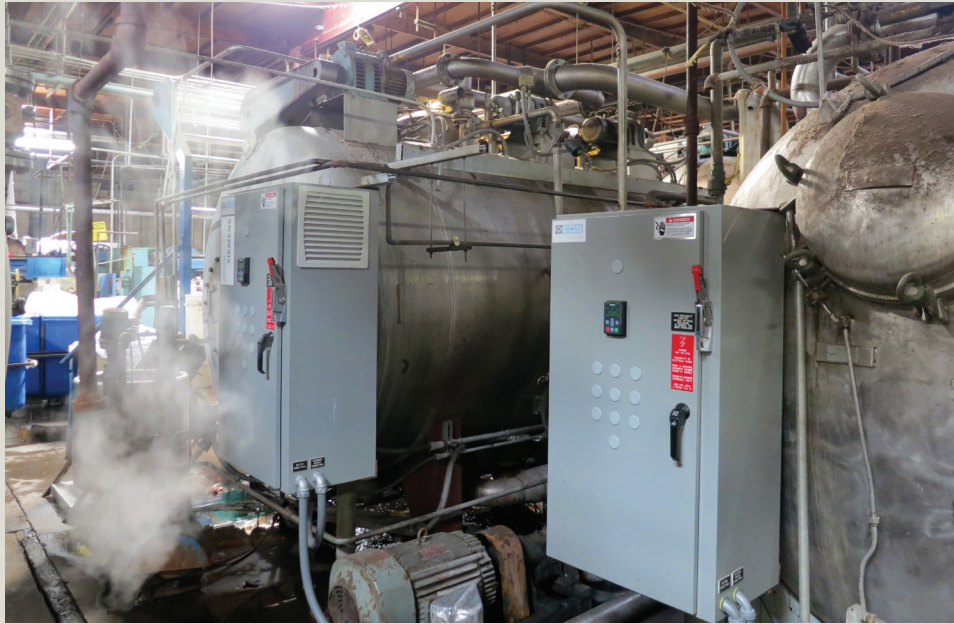
Typical installation on the fabric and garment dyeing machines at L.A. Dye and Print, located in Gardena, CA