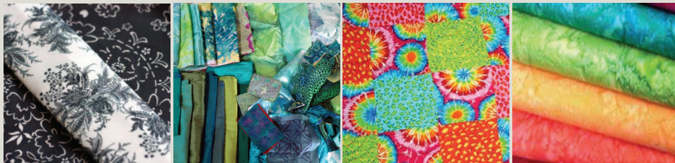
Some of the myriad fabric colors and patterns produced and printed by the end-user