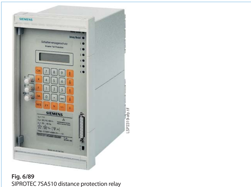
Fig. 6/89 SIPROTEC 7SA510 distance protection relay