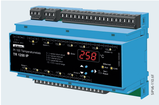
Fig. 13/113 7XV5662-8AD10 RTD-box TR1200 IP (Ethernet)