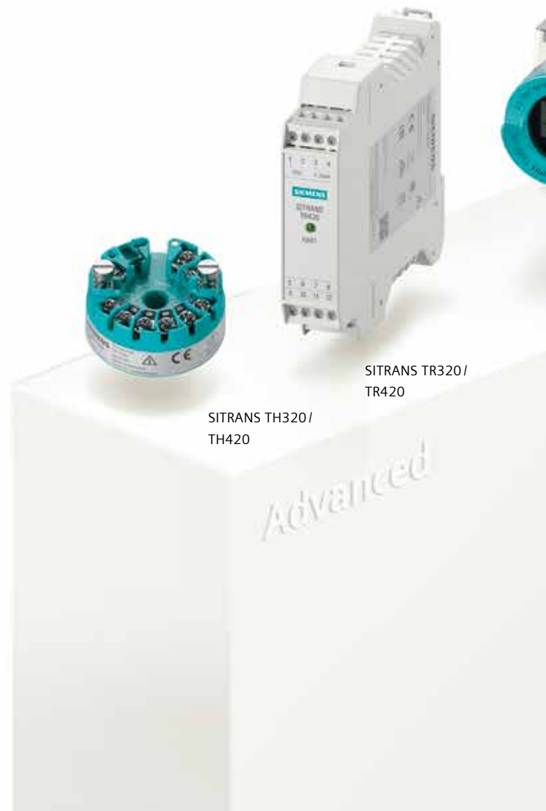
SITRANS TH320 / TH420