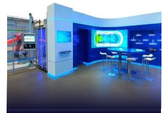
Additive Manufacturing Experience Center (AMEC)