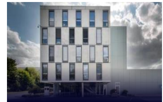
Digital Experience Center (DEX)