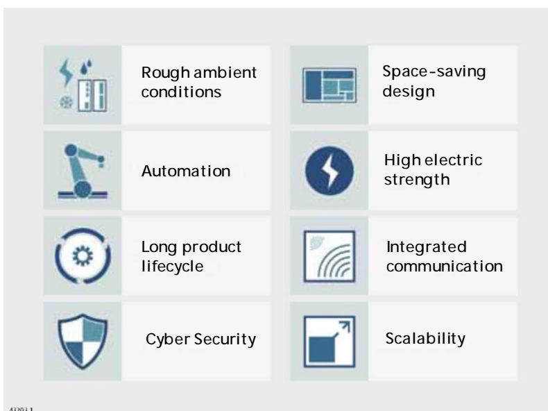
Fig. 1. The devices to be used must provide a wide range of features.

Siemens answers these requirements with the modular device range Sicam A8000 - a new telecontrol and grid automation system for use in electrical power supply. This series is a module combination of processor, energy supply and expansion modules for inputs and outputs (Fig. 2).