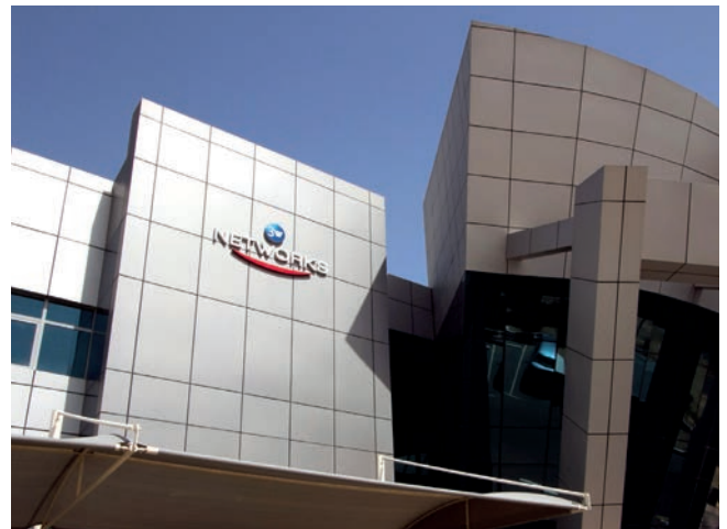
3W office in Dubai, U.A.E.

As it has done so often for more than a decade on projects across the region, 3W Networks turned to Siemens to help meet the challenges posed by the unique requirements of this project.