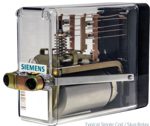
Typical Single Coil / Slug Relay