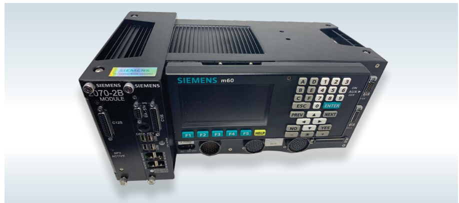
m60 ATC Cabinet-Ready Controller

The latest additions to the m60 series are the m60 ATC Cabinet-Ready controller and the m60 ATC LITE Cabinet-Ready controller. These controllers feature an ATC Cabinet compatible backplane which provides an innovative approach to those preferring to utilize an ATC shelf-mount cabinet. These new controllers will come with an "ATC Cabinet-Ready" product label to indicate that they come with an ATC Cabinet Compatible Backplane.