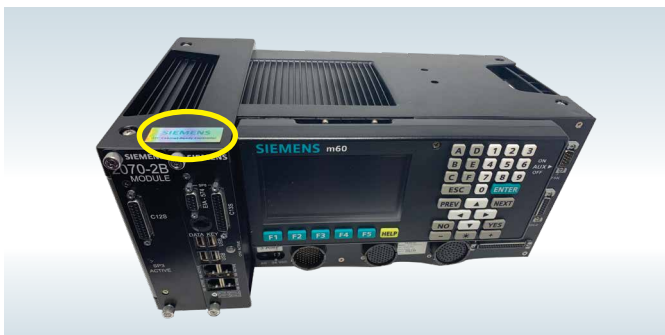
Product Label placement on all controllers containing the ATC Cabinet Compatible Backplane

The following Product Label will be included on all controllers which contain the ATC Cabinet Compatible Backplane. In order to connect any m60 series controller to an ATC Cabinet, an ATC Compatible Backplane and ATC Cabinet Module are needed.