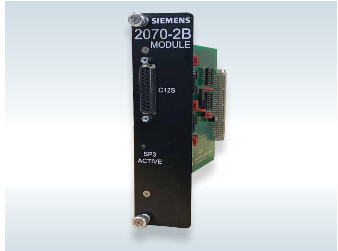
ATC Cabinet Module