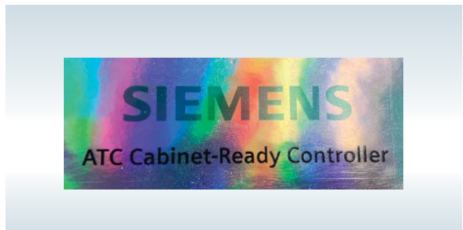
Product Label indicating presence of ATC Cabinet Compatible Backplane