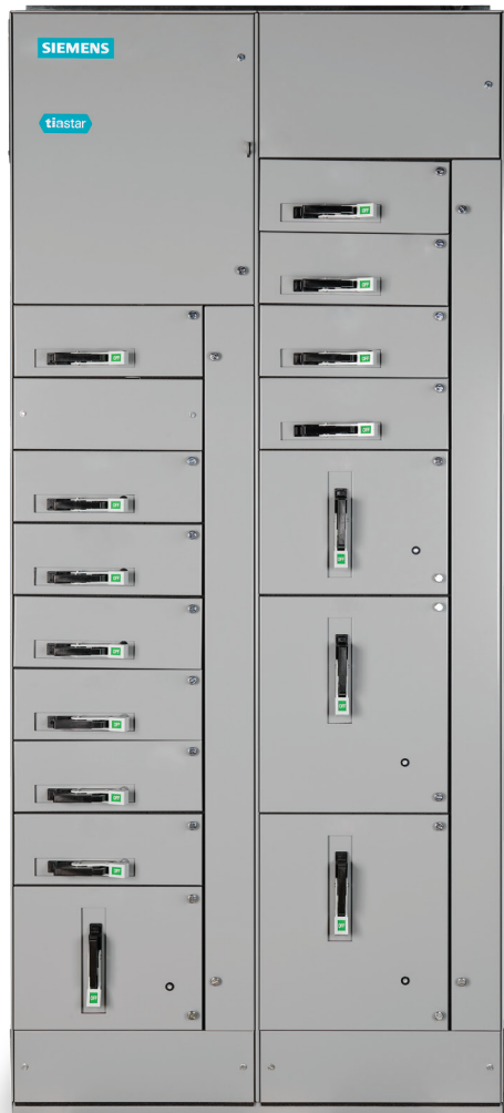
Siemens tiastar High Density Motor Control Centers save 25% floor space.

For example, use the increased room to fit more racking space and conveyors in warehouse environments, more production equipment into facilities like oil rigs; or even provide additional living space or more amenities into high rise buildings.