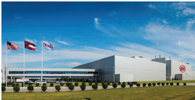
KMMG has added 6,000 jobs in Troup County in the last five years.

The strong connection to the business community starts on the first day of school when business leaders line up to greet students as they get off the bus. That connection continues throughout as business leaders and employers are active participants at the school. In fact, the school's Governance Board includes 15 business leaders.