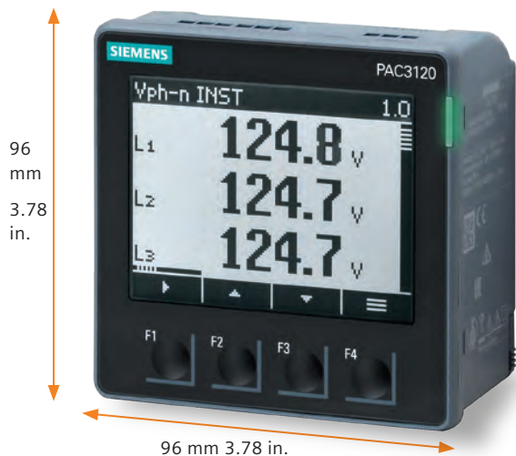
Full graphic LCD display to indicate: Display title or designation of the displayed measurements, phase, measured value unit and labeling of function keys