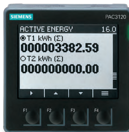
Example of operating menu: With an easy-to-read adjustable back lit LCD display, the PAC3120 can be commissioned in only two steps. After selecting the language and setting two parameters (voltage and current inputs), the meter is ready for use. 1)