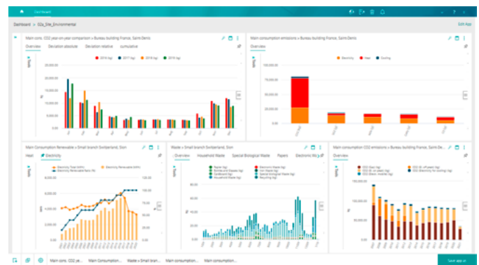
Example: Environmental dashboard