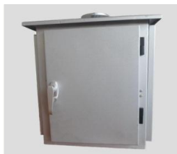
Motor drive 3DV8

Since the 1930s, Siemens has exported disconnectors and related components throughout the world. Based on the “genetic code” of the proven Siemens disconnectors, the portfolio has now been enhanced and harmonized to respond even better to varied customer needs and to make it easier for you to select the right product.