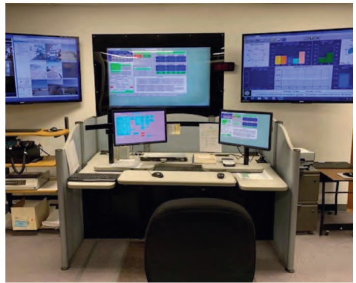
Control room with two operator stations.