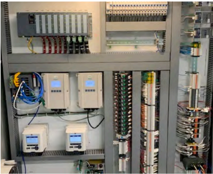
HydroRanger 200 HMI is an ultrasonic level controller that provides control, differential control, and open channel flow monitoring.