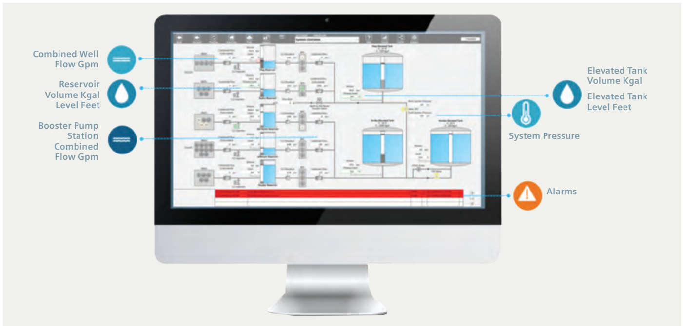
SIMATIC WinCC Open Architecture (OA) SCADA software provides an operational dashboard with system-wide visibility that the City of Hobbs never had before.

“TESCO did a great job engineering it all for reliability, high availability, and resiliency, along with thoughtful cabinet fabrication. And Alpha Southwest installed everything on-schedule and budget. The collaboration, cooperation, and communications among everyone couldn’t have been better.”