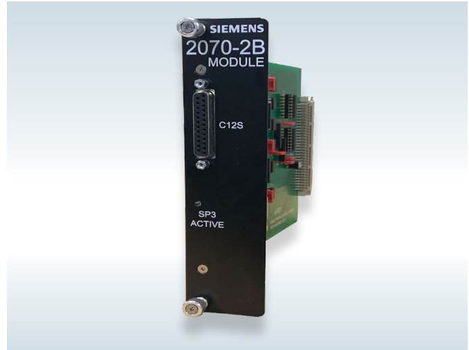
ATC Cabinet Module