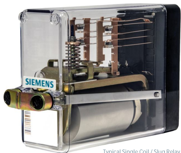
Typical Single Coil / Slug Relay