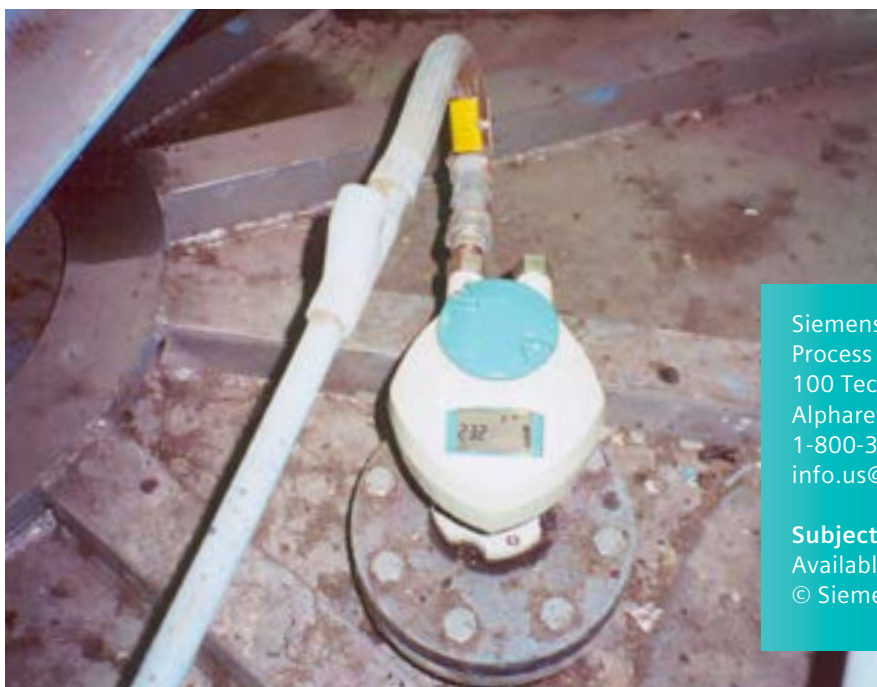
Fig. 4: Siemens has taken the experience of how to differentiate between false echoes and true echoes from over a million individual applications, and distilled it into the "Process Intelligence" software that goes into each one of its radar devices, like this Sitrans LR200 unit.

One thing is clear though: cement is an industry that embraces new technology, which has certainly been the case with the introduction of a 78 GHz radar level measurement device with a narrow beam. This new radar technology isn't affected by dust, vapour, or temperature, and can effectively measure solids, even those with a steep angle of repose. Since its introduction in 2011, cement producers have collectively rushed out to adopt a product that, because it can be applied in virtually all areas of the cement plant, is one of a kind.