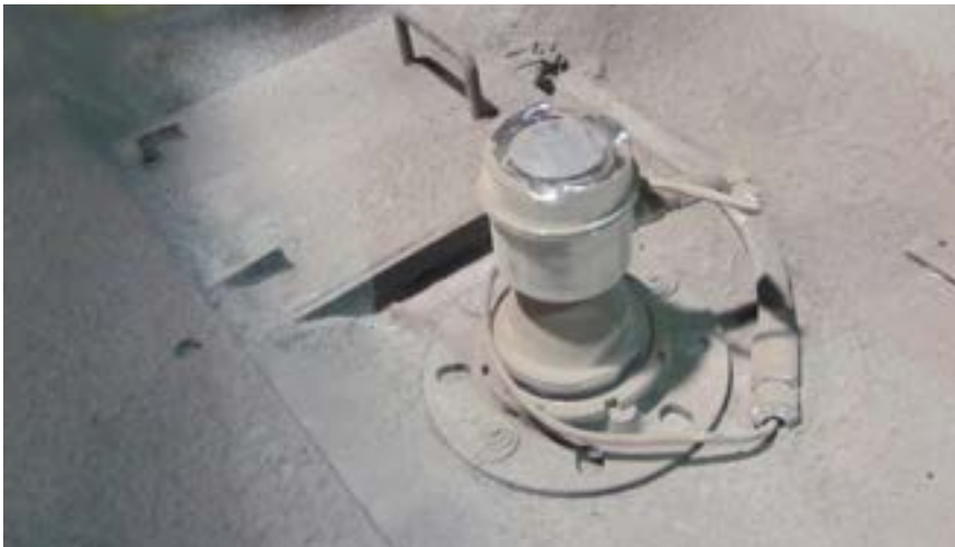
Fig. 2: The Sitrans LR560 is the ideal radar device for dusty environments. In addition, it emits a short wavelength (78 GHz), so is able to accurately measure the level of solids, even when the material is piled on a steep angle.

“These instruments were easy to install and set-up, and they have been working fine.”