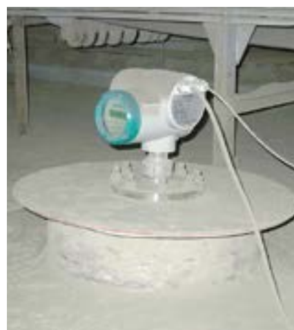
Fig. 3: Sitrans LR400 units such as this one were installed well over a decade ago, and continue to provide reliable level measurement readings to this day.

A major cement plant in Texas has learned the hard way that, when the