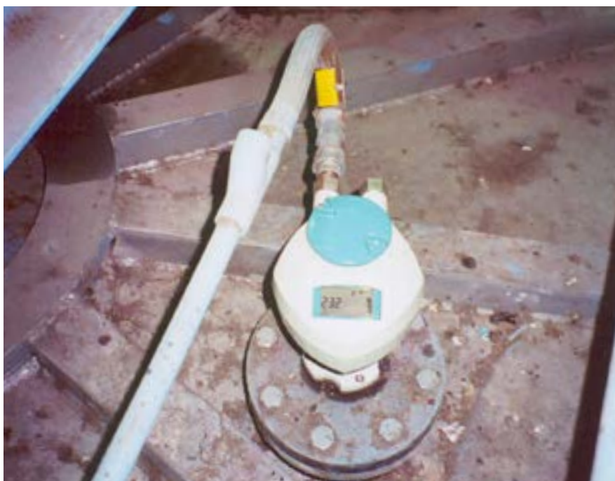
Fig. 4: Siemens has taken the experience of how to differentiate between false echoes and true echoes from over a million individual applications, and distilled it into the "Process Intelligence" software that goes into each one of its radar devices, like this Sitrans LR200 unit.

One thing is clear though: cement is an industry that embraces new technology, which has certainly been the case with the introduction of a 78 GHz radar level measurement device with a narrow beam. This new radar technology isn't affected by dust, vapour, or temperature, and can effectively measure solids, even those with a steep angle of repose. Since its introduction in 2011, cement producers have collectively rushed out to adopt a product that, because it can be applied in virtually all areas of the cement plant, is one of a kind.