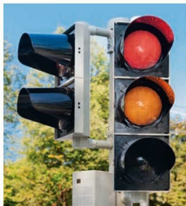
Signal heads, traffic controllers and peripherals in 1Watt Technology – that is Sitraffic One

Just like all other Silux2 LED signal heads, Silux2 VLP can be equipped with various removable symbol inserts, which are designed as masks and can be easily fitted on the inside of the detachable front lens. Upon request, non-standard symbols are available at short notice. Replacing or rotating the symbol inserts can be done on site, thanks to the integrated door, whose easy-to-open bayonet lock is a real time saver.