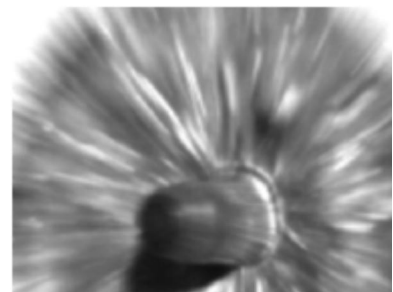
A VPAM Class 13, .50 BMG M2 AP round – representing the highest likely ballistics threat – being reflected by the Siemens protection system.