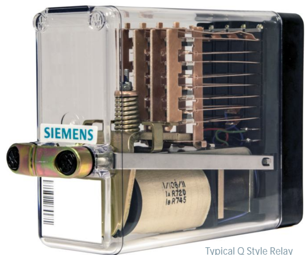
Typical Q Style Relay