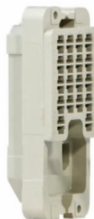
Un-drilled plugboard Part No. E7218/1