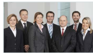
Your Siemens IR Team