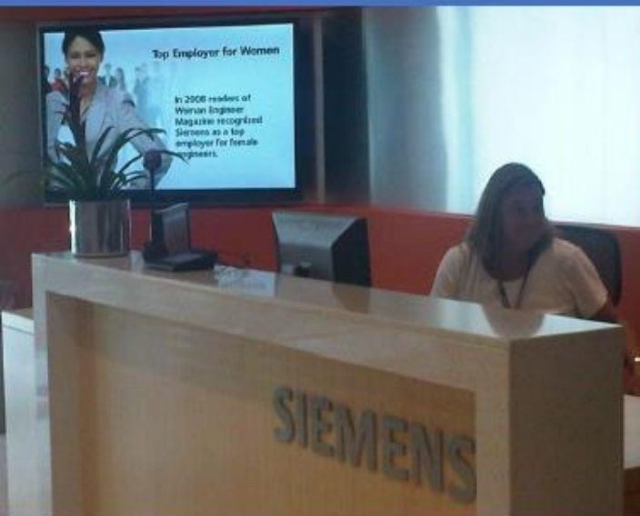
GSS Reception Area

Minority Owned Small Business Supplier of the Year Keiki Enterprises LLC dba DSignage