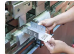
Sheet Metal / Progressive Stamping