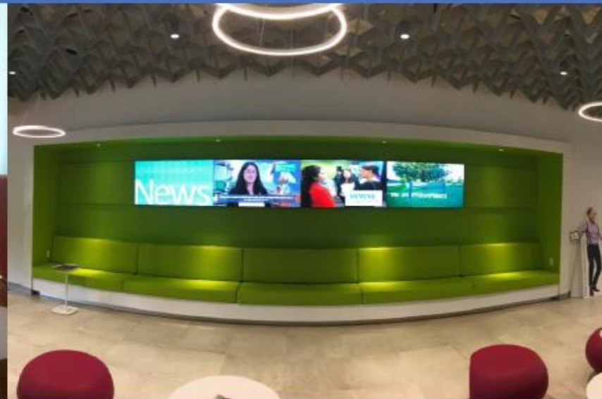
Welcome Video Wall in SIE CT Princeton, NJ