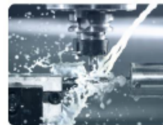
Precision Tooling / Wire Cut / Laser Cut / CNC Machining