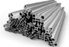
Aluminum / Stainless Steel Casting & Extrusion