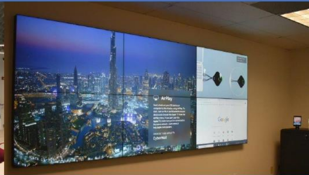
Cyber Security Wall in Alpharetta, GA