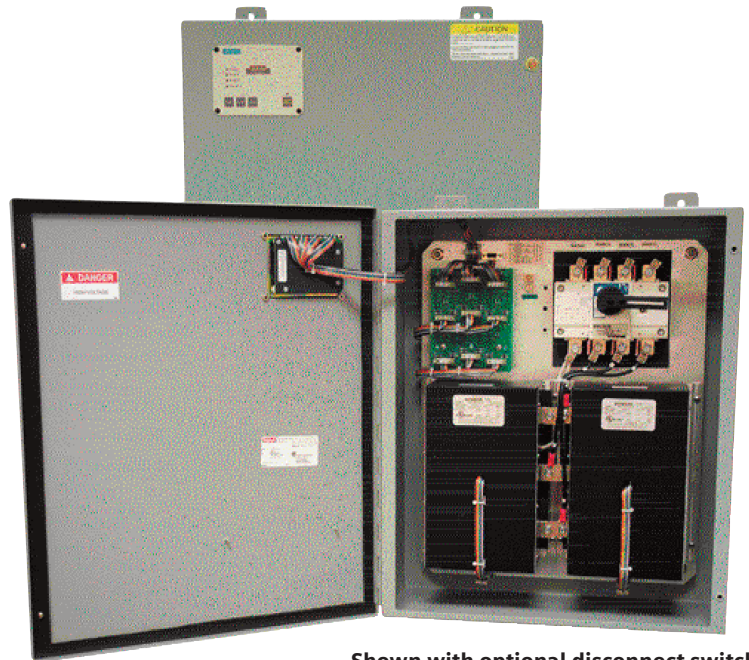
Shown with optional disconnect switch