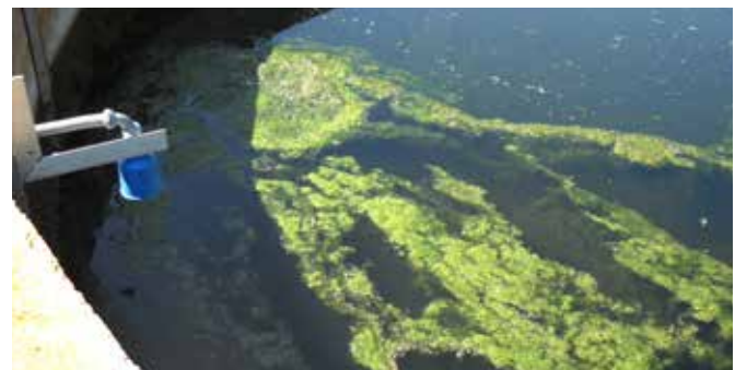
Figure 3.a.b.c. Effluent Discharge Basin V-Notch Weir for discharge flow measurement and Echomax Transducer for level measurement notice the algae build up

deploy SITRANS store IQ. Deploying this digital application included the development of a comprehensive solution to provide remote monitoring of the instruments and equipment at the customer's site and in accordance with their specific needs. The customer had located the HydroRanger 200 20 – 30 yards from the effluent treatment basin, and this included the availability of 120Vac. The mounting position of the HydroRanger200 was perfect for the installation of the SITRANS store IQ solution.