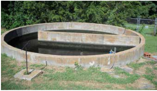
Figure 2. Effluent Discharge Basin and inlet underground valve handle located in line from the Polishing Pond

City of Decatur was already using a HydroRanger 200 with Echomax transducer to monitor the effluent flow from the Wastewater Treatment plant and record the Effluent Basin level. The HydroRanger data was recorded so the staff would be aware of any changes that could indicate the potential of a blockage or loss of flow. It's also worth noting that the HydroRanger 200 was not connected to any SCADA and as such required a physical visit to manually read the totalizer and other process information from this instrument. These values were read daily for reporting purposes.