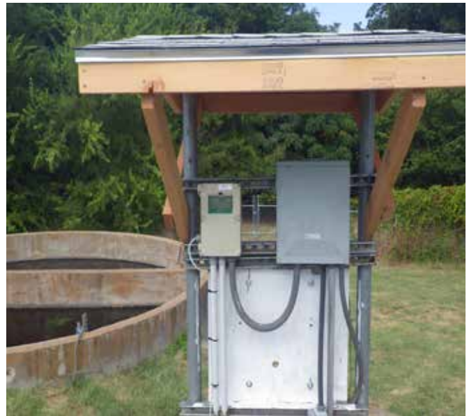
Figure 4.a.b HydroRanger 200 mounting stand and StoreIQ remote monitoring solution

The addition of the Siemens SITRANS store IQ hardware solution and App allows the City of Decatur immediate access to the flow rate, totalizer and head measurement on their smart phone, tablet or from their computer. Alarms alert the customer when the head value falls below a specified alarm level, warning them if there is a problem upstream of the effluent basin and high-level alarms if the head value rises above a specified alarm level. This provides peace of mind that the plant is monitored, and personnel can respond to emergencies when they happen even if not at the plant.