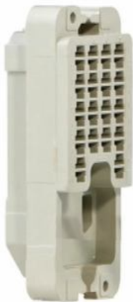
Un-drilled plugboard Part No. E7218/1