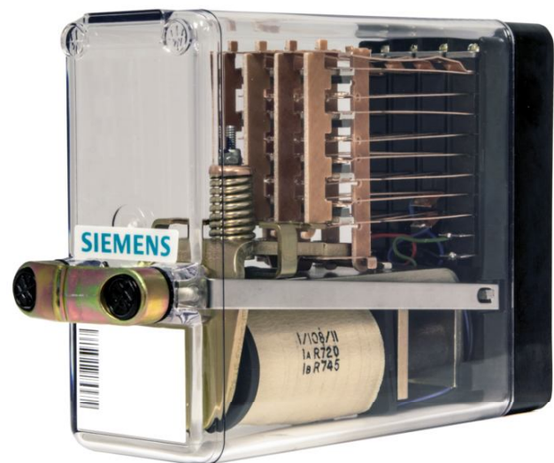
Typical Single Coil Relay