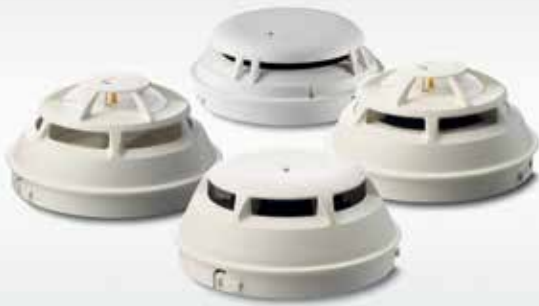
Data centers, telecommunications facilities, office buildings, or industrial production facilities – Cerberus PRO offers a detector for any application.

A comprehensive offering of standard detectors and advanced detectors with ASAtechnology ™ offer versatility to protect clean, dirty, or normal environments.