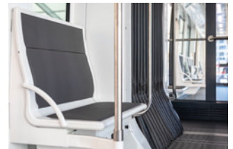
Fixed passenger seat