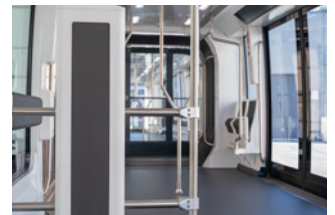
View from wheelchair space