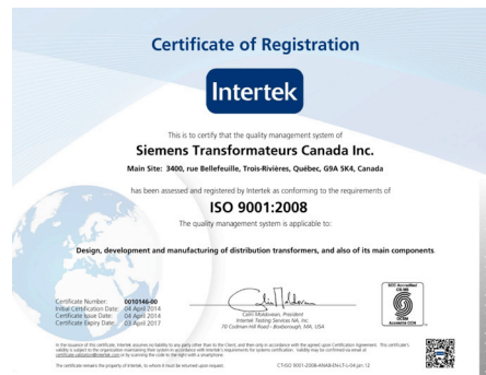
ISO 9001:2008 certificate

When it comes to quality assurance, we like to take our service to our customers even further. Prior to the sale, we advise our customers on the parameters that will yield preferred, required, and, possibly, added benefits. Project management and order processing are handled by service-oriented employees on whom our customers can rely. And, of course, our after-sales service is also available to you after the transformer has been delivered.