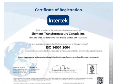
ISO 14001:2004 certificate