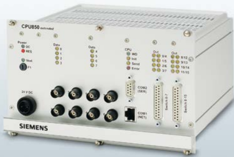
Imu 100 receiver CPU850 (Extended type)