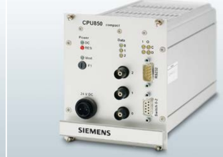
Imu 100 receiver CPU850 (Compact type)