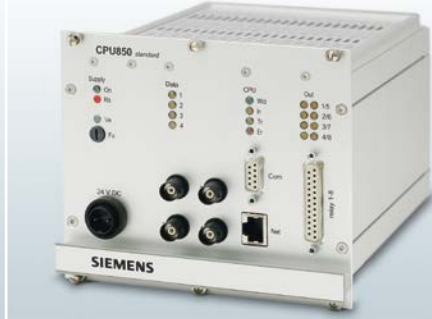
Imu 100 receiver CPU850 (Standard type)