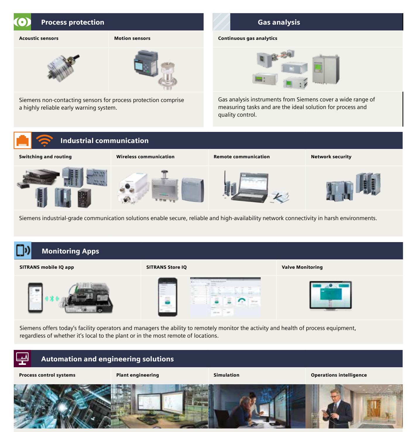
To maximize efficiency and competitiveness in an increasingly digitalized world, Siemens provides innovative solutions for process control, plant engineering, simulation and operations intelligence.