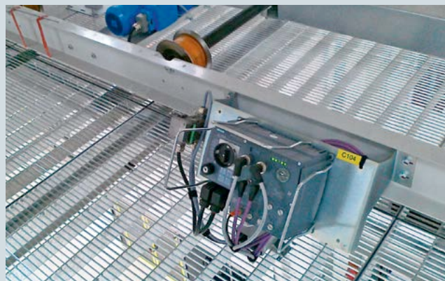
SIRIUS M200D motor starter are used at SEAT in Spain

In addition, the SIRIUS M200D motor starter also supports the future-oriented and manufacturer-independent PROFlenergy profile on PROFINET. This facilitates efficient energy management in production plants on the basis of controlled energy consumption, doing away with external permanently wired systems.