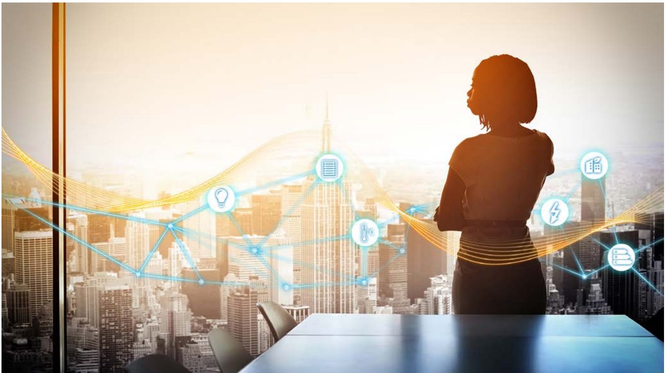
Smart offices add value to people and business.

The report concludes with a summary of Siemens' commitment to further develop the office market by deploying its people-, technology-, and service-centric approach. By doing so, it extends the possibilities of the future smart office and bring its key attributes and experiences a level higher.