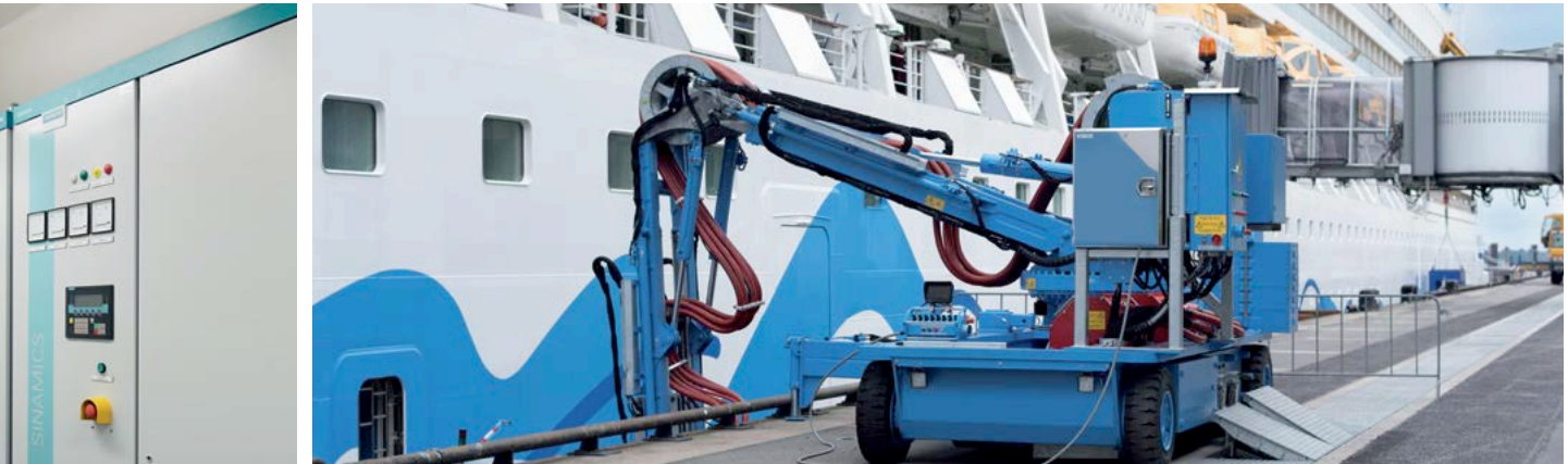
Quick and easy connection to the ship via the cable management system