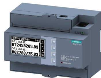
7KM PAC2200 MID measuring device