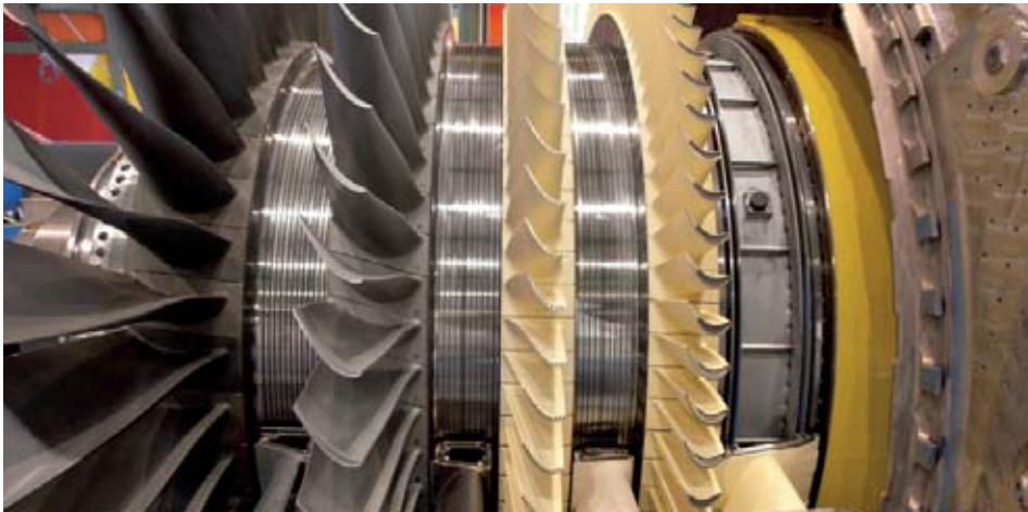
Siemens innovative 3D optimized blades on turbine stages 1 and 2