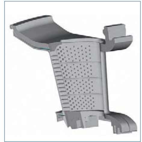
3D-CAD model of Siemens innovative 3D optimized turbine vane stage 1

The scope of this modernization includes the following new designed profiles and additional turbine parts: