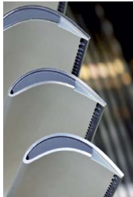
Siemens innovative 3D optimized turbine blades

The Siemens innovative 3D optimized turbine blades and vanes for stages 1 and 2 are state-of-the-art for new Siemens gas turbines of the SGT5-2000E (V94.2) since July 2008 and are also applicable for the SGT6-2000E (V84.2) frames.