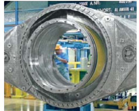
New inner casing design