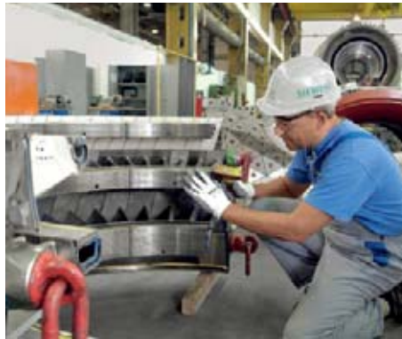
Blading of turbine rows

The Firing Temperature Increase upgrade with the above mentioned scope of supply is applicable for the SGT5-2000E (V94.2) and SGT6-2000E (V84.2) gas turbines and may be combined with other Siemens' modernizations.