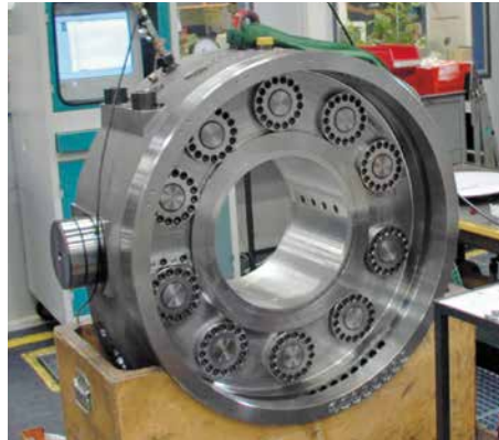
Hydraulic Clearance Optimization bearing

Usually it makes sense to install this upgrade during a major outage. We offer a full range of field service