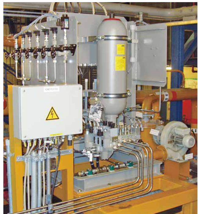
Hydraulic Clearance Optimization pump skid

The HCO provides significant performance advantages and offers attractive financial payback options.