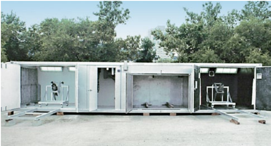
Mobile coating unit

The Advanced Compressor Coating is applicable for all Siemens V-Frames and may be combined with other modernizations such as the Advanced Compressor Cleaning System.