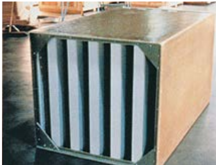
Prefabricated CPI plate rack, designed for easy removal as an assembly.

The information provided in this literature contains merely general descriptions or characteristics of performance which in actual case of use do not always apply as described or which may change as a result of further development of the products. An obligation to provide the respective characteristics shall only exist if expressly agreed in the terms of the contract.